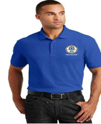
Stock # K100

Port Authority Core Classic Pique Polo 60/40 Cotton/Poly pique