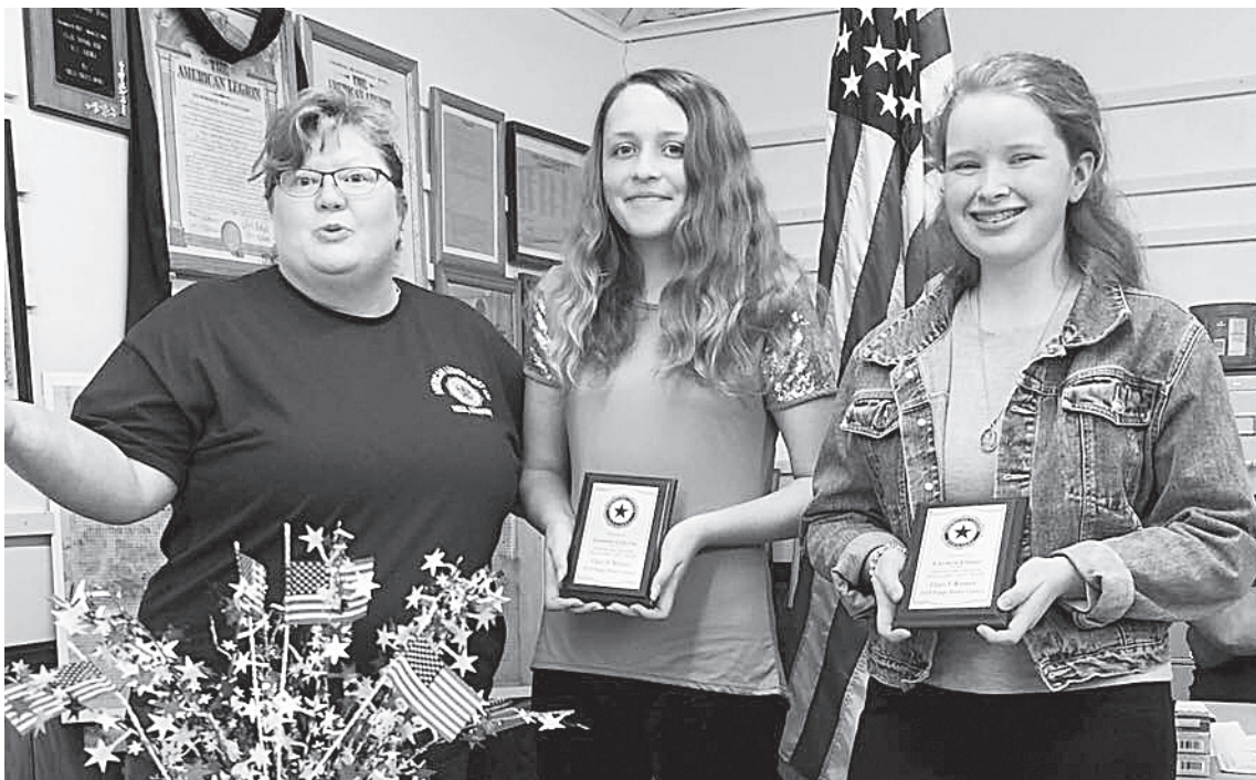
The American Legion Auxiliary Unit 434 sponsors the Poppy Poster contest as part of the Poppy Program. The red poppy became known as a symbol to those who shed blood to protect America's freedom. Moina Michael read the wartime poem "In Flanders Field" by Lt. Col., John McCrae that is in memory of our veterans. This was her inspiration to promote the red poppy. Since 1923 millions of red paper poppies are distributed by the American Legion Auxiliary members in their communities. It continues to symbolize those veterans who gave the ultimate sacrifice for the American people.

Twenty-four students from Nixa High School submitted artwork. The posters were judged on poster appeal and in compliance with specific contest rules. Each contestant received a participation award. The winning posters were then submitted to District 17 committee for further judging. Those winners were forwarded to the American Legion Auxiliary Department. The final level for judging is National. The winners here will then receive recognition at the National Convention.