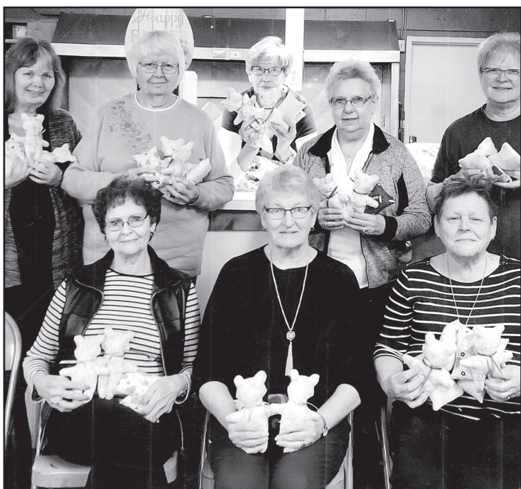
Members of American Legion Auxiliary Unit 478 have a yearly project with Children's Mercy Hospital. The ladies sew approximately 1,200 small bears and mini pillows each year for the PIC unit to help support the tubing used on the babies. Each of the members loves to combine her favorite colors to make these special bears and mini pillows.