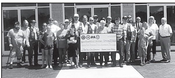
ALA Unit 114 members recently presented a $24,500 check to the Missouri Veterans Cemetery in Bloomfield. This check makes the total donated the past six years over $110,000. The donations provided some major renovations to the cemetery such as the bell tower and installation of a central air/heat system with insulation in the committal shelter.