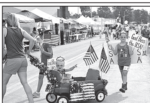
The Boy Scouts led the Sesquicentennial Kiddie Parade that was held during the annual Soybean Festival. Norborne Post and Unit 551 sponsored the parade.